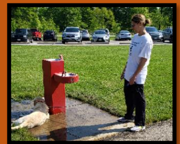
Bollie Boys' Team

This dog had the right idea after his walk...roll in a water puddle!